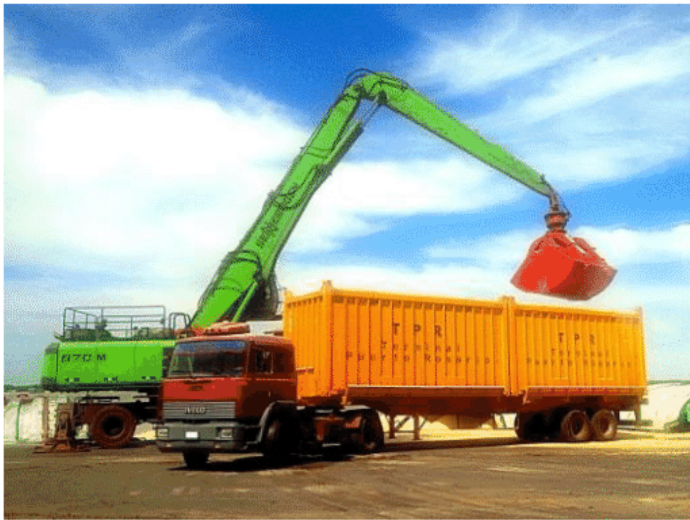
Figure 4 – standard port equipment loading container