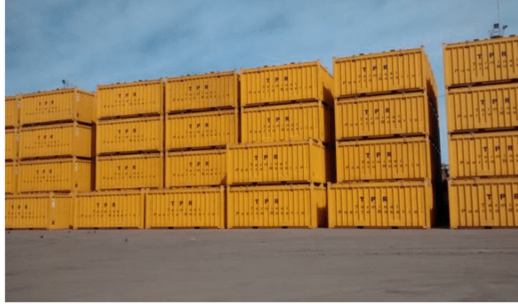
The CBH system with sealed container stored at port

The only way to access the grain or commodity is via the special food grade sampling port fitted within the container. To overcome the high capital set-up costs the containers are leased, reducing the capital that would otherwise be tied up in a silo which would remain empty for long periods throughout the year.