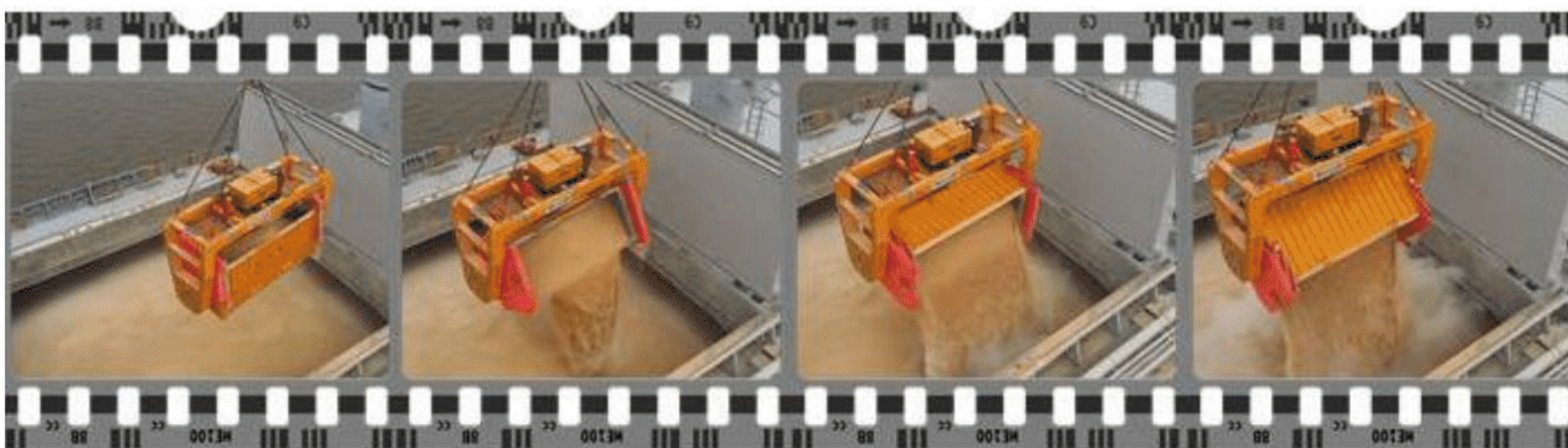
Figure 9 – Revolver unloads the grain by gently rotating the container

As the grain is sealed in the container at the farm and only opened at the bottom of the vessels hatch, there is no material loss or contamination. The revolver process differs from normal bulk loading as it is very gentle and adds very little energy to the material. The revolver lowers the container almost to the bottom of the hatch and tips it gently. The result is a reduction in dust. With less dust in the air, workers can breathe a lot easier.