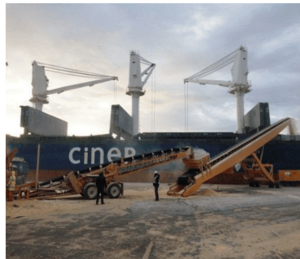
Figure 3 – Bulk Conveyor system at a port