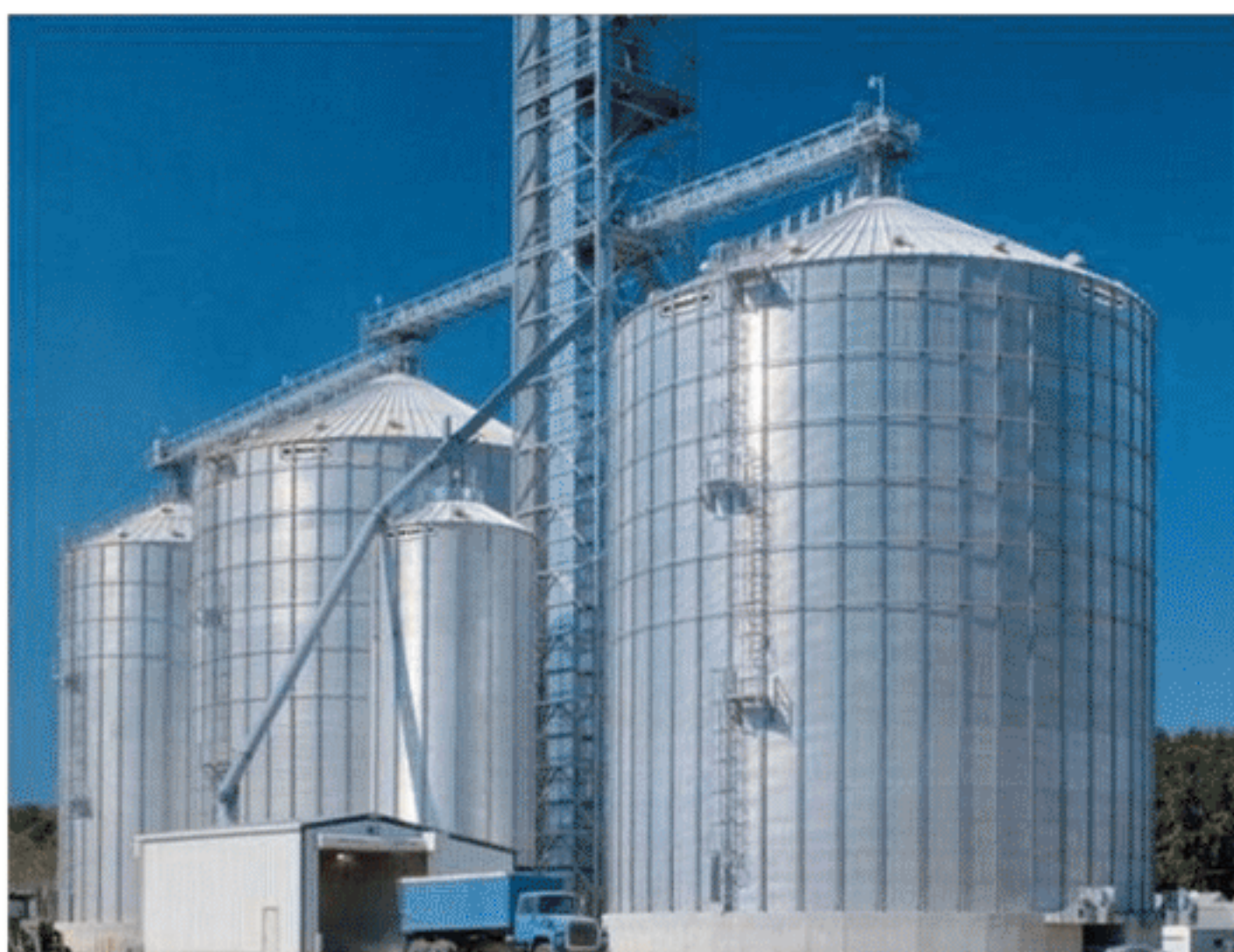
Figure 2 – Typical Silo set up at the facility

Traditionally, the method of exporting grain involves the use of dump trucks, special bulk rail-wagons, silo and then dedicated bulk loaders. The problem with the conventional systems is the high cost and an inflexible fixed structure at the port which prevents other activities. Material losses at transfer points, cleanup costs and in some cases contamination of the grain by unwanted rodents are further problems in the logistics process.