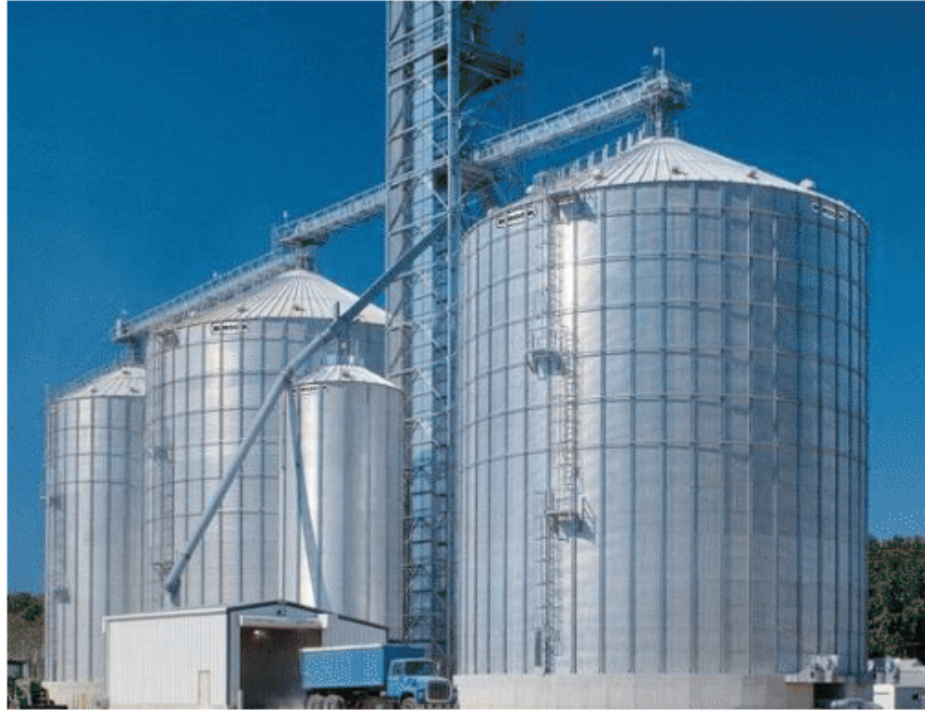
Typical Silo set up

The most innovative aspect of the new system is the use of the container as a silo and a method of transport. Traditionally grain exporters needed expensive silos costing over 20 million dollars, which prevented a number of ports from exporting grain. With the containers acting as both storage and transport, the containers are sealed directly after filling.