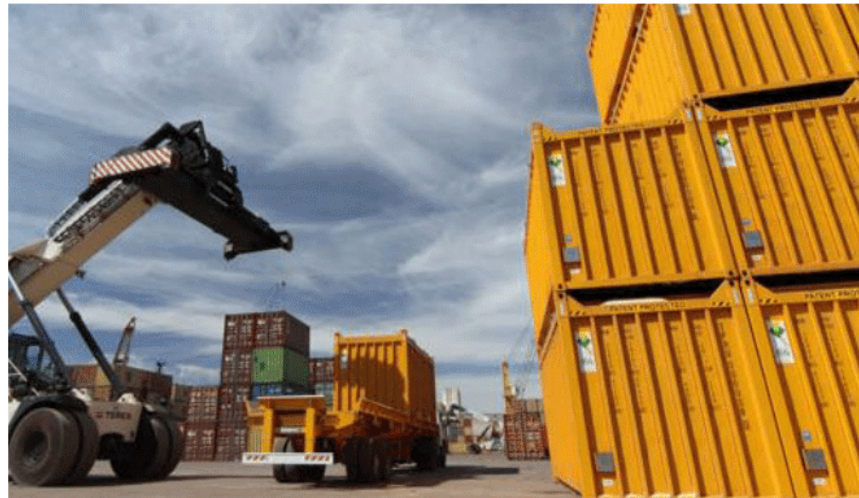
Figure 5 – Sealed container stored at port

The CBH system is simple and involves loading the agri-bulk at the farm or storage location into specialized 20' high cube containers with a payload capacity of 27 tons. The containers are sealed with lids to protect the product from rain or contamination and eliminate potential dust and spillage.