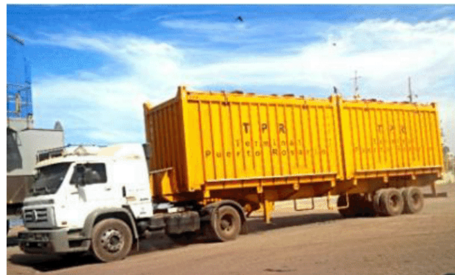
Figure 6 & 7 – Trucks loaded with sealed containers containing grain head to the Port

The sealed containers are then transported to the terminal's yard and stored ready for loading. The containers replace the need for expensive silos.